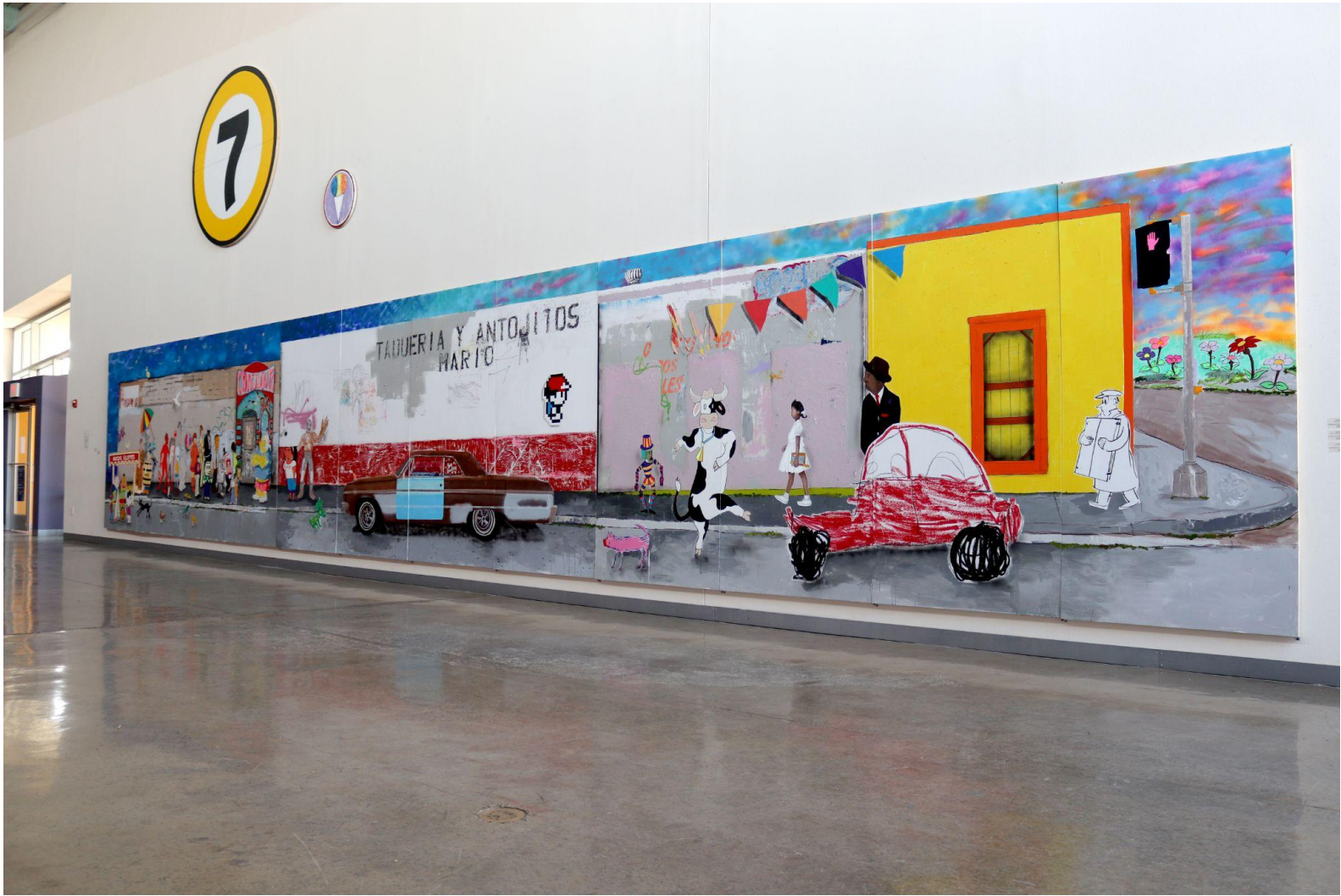
The piece was presented in its entirety (barrioPOP solo show) at the Louise Hopkins Underwood Center for the Arts (LHUCA) Lubbock TX, 2019