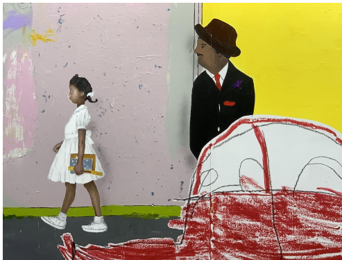
My mom attended pre school in this yellow building, a popular icon here in Brownsville recently torn down.