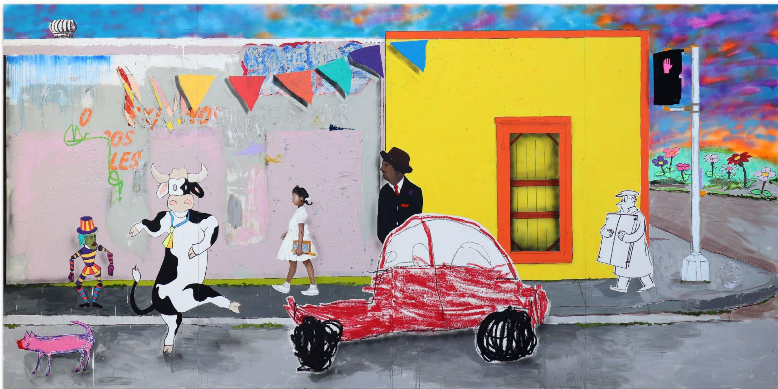
Around the Corner , 2019, multimedia painting with transfer on multi-panel, 96x192 inches.

On the opposite corner a dancing dairy cow performance to the faint conjunto sounds emerging from El Tucans nightclub, next to a red electric car, a mom-&-pop screen door store (tiendita). In this barrio corner everyone is always welcome.