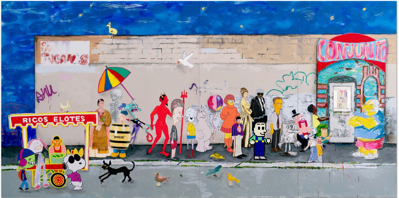
Conjunto Queue , 2018, multimedia painting with transfer on multi-panel, 96x192 inches. The line (queue) by a cast of characters from Mexican and American pop culture, about to enter El Tucans conjunto music nightclub.