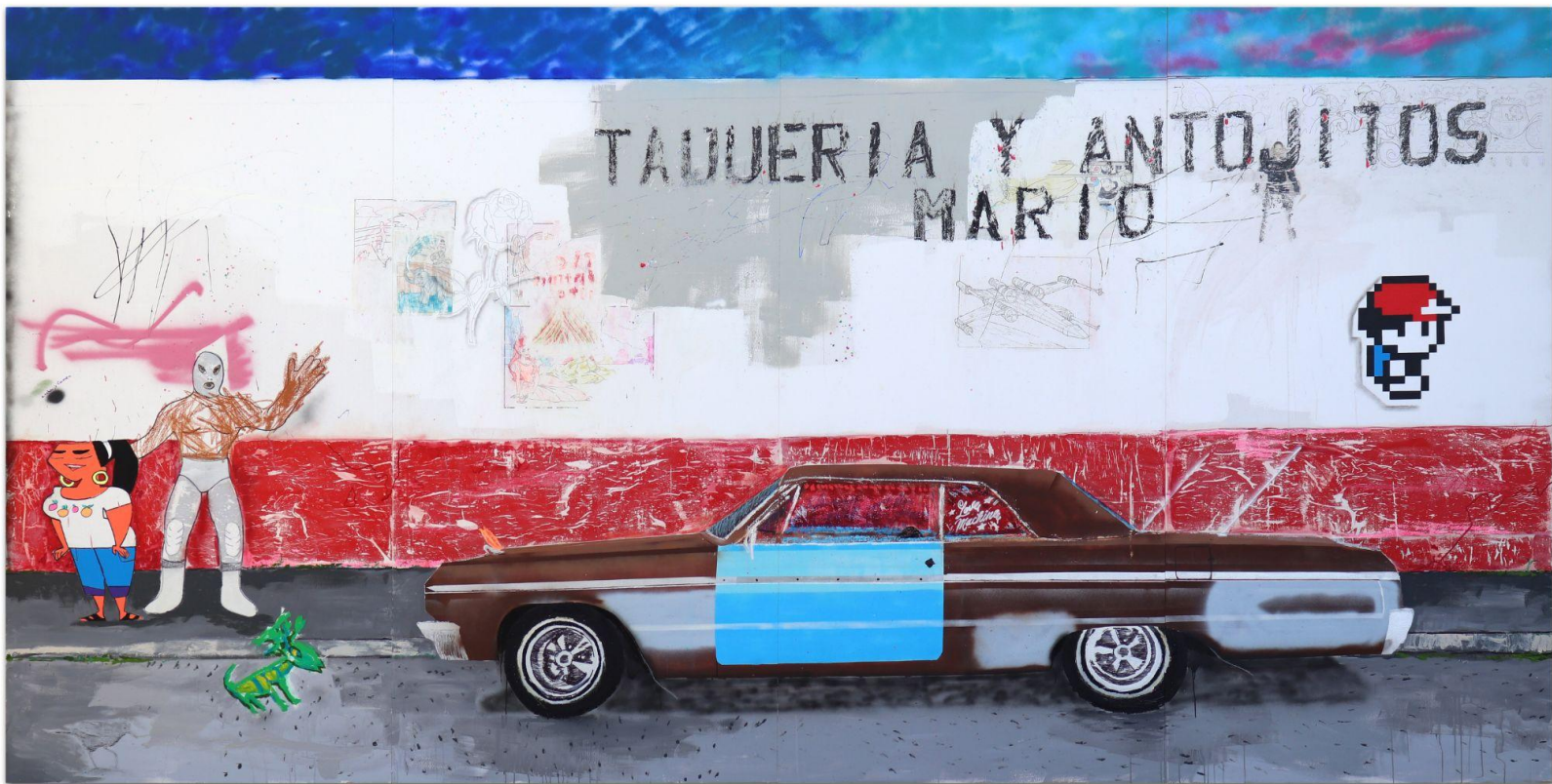
Give me a ride Love Machine , 2019, multimedia painting with transfer on multi-panel, 96x192 inches.

The world's most iconic lowrider (The Love Machine) parked front and center outside an abandoned taqueria, in this case the iconic 64 Impala is owned by an odd couple, El Santo (luchador) and his tiny girlfriend on their way to dance the night away at the conjunto music nightclub, El Tucans.