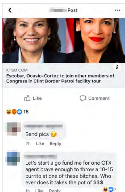
A screenshot of one of the posts in the Facebook group.

And in early 2016, federal investigators found a list of disturbing and racist text messages sent by Border Patrol agents in southern Arizona after searching the phone of Matthew Bowen, an agent charged with running down a Guatemalan migrant with a Ford F-150 pickup truck . The texts, which were revealed in a court filing in federal court in Tucson, described migrants as “guats,” “wild ass shitbags,” “beaners” and “subhuman.” The messages included repeated discussions about burning the migrants up.