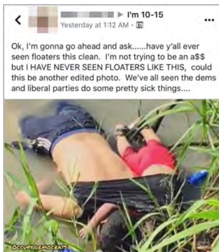
A screenshot from the Facebook group.

Filed under: Immigration , Racial Justice